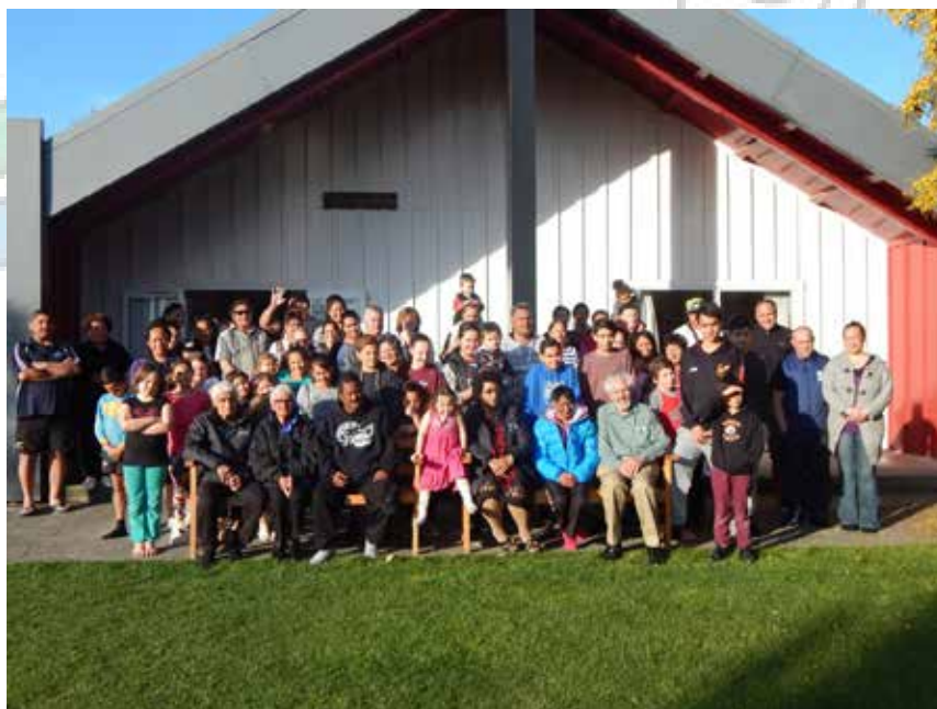
Otautahi - 3 rd October 2015