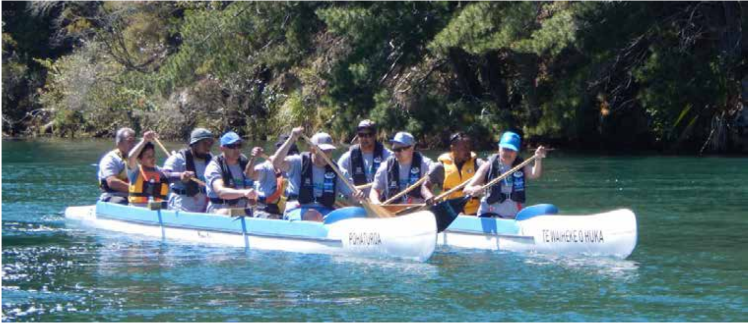
The Ngati Tahu-Ngati Whaoa Paddlers