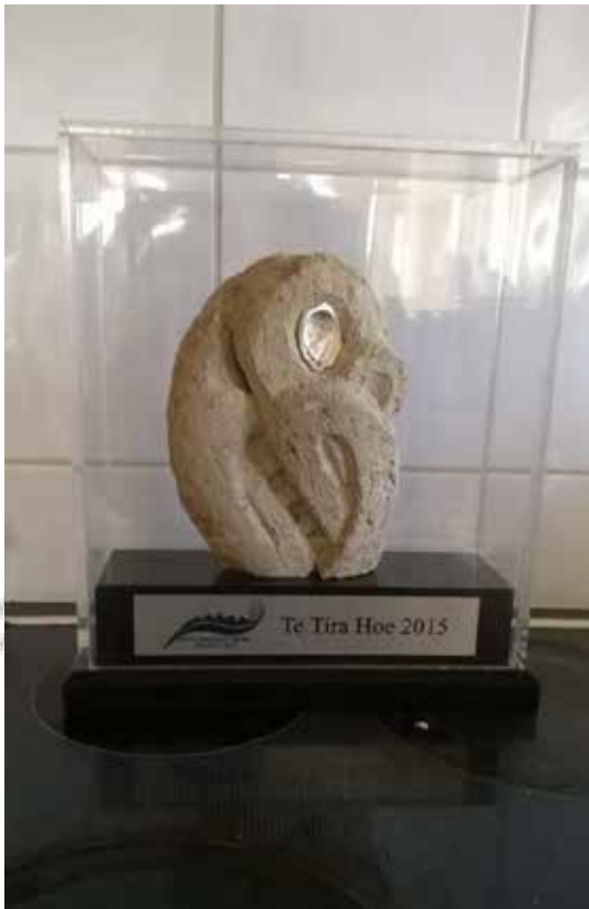
Taonga to Waikato Tainui