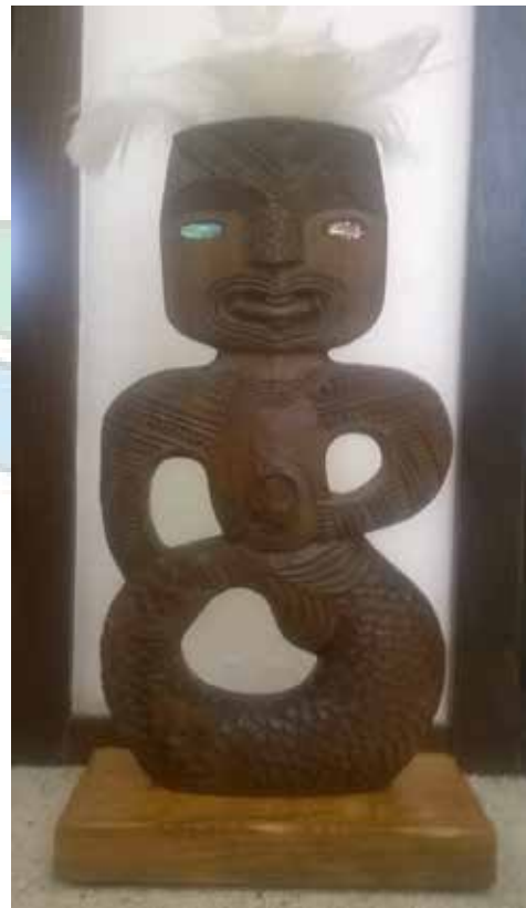
Taonga to Ngati Tahu-Ngati Whaoa

Kia mau koe ki nga kupu o ou tupuna Hold fast to the words of your ancestors