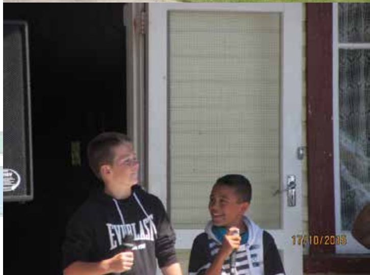
Winners of the Talent Quest