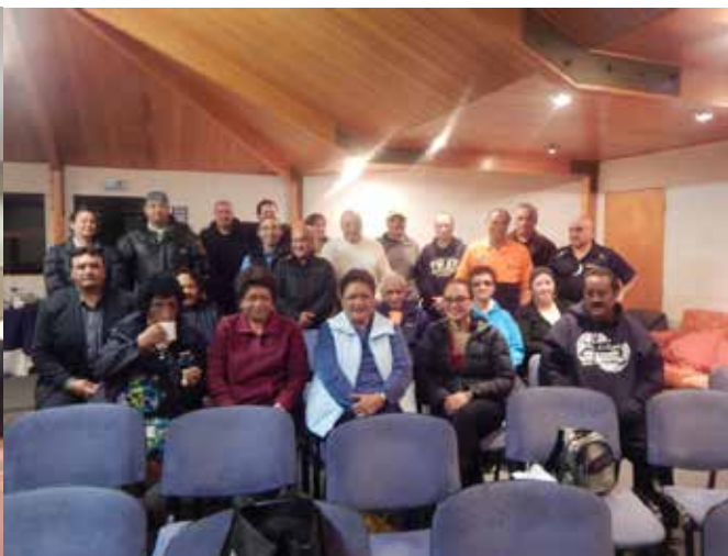
Poneke – 26 th September 2015

Contact our Subcommittee members if you would like to attend one of their hui: