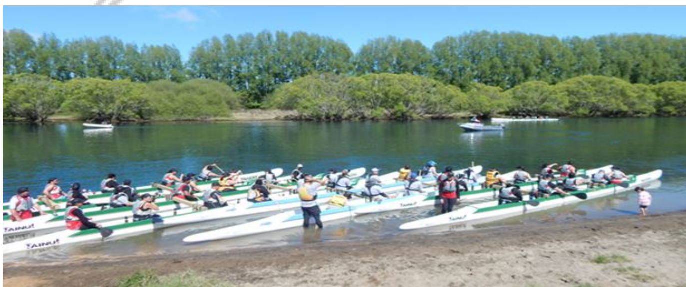
Launching from Vaile Road Reserve

The class also supports many powhiri, tribal events, and hui that the trust participates in. One of the more recent events was the Tira Hoe 2015, which we are invited to participate by Waikato/Tainui who complete the event annually. This year we undertook a 30+km paddle from Vaile Road Reserve to Ohakuri Reserve, stopping along the way to share our historical stories. The flotilla was a beautiful site to see on the awa and the day was thoroughly enjoyed by paddlers and support crews.