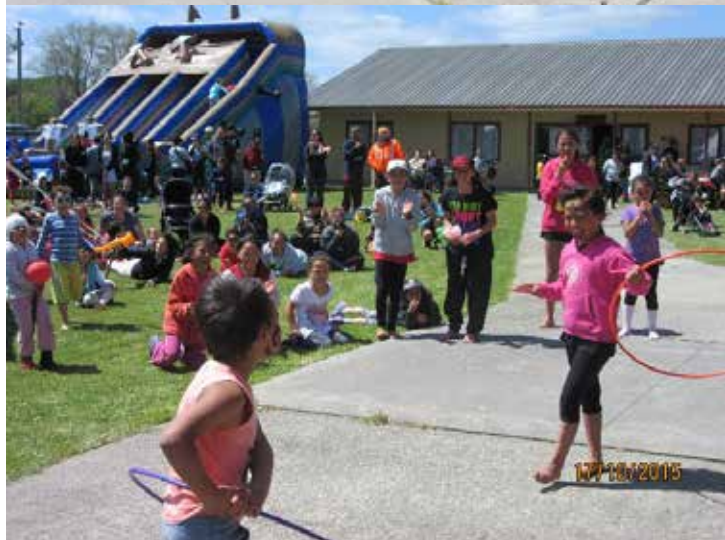
Whanau Enjoying the Entertainment