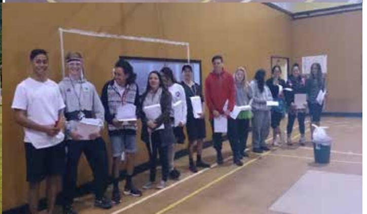
Te Roopu Aroha