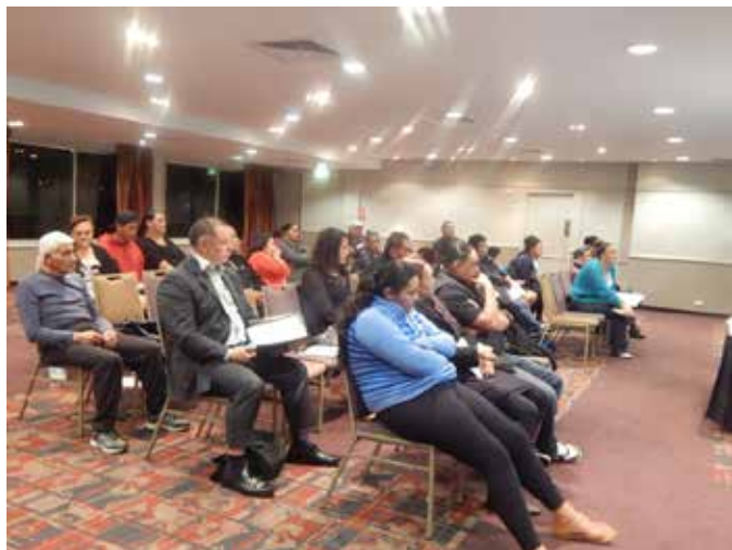
Tamaki Makaurau – 25 th September 2015

The Runanga Board and kaumatua once again travelled to our 3 main city centres (Auckland, Wellington, Christchurch) to update whanau on the mahi undertaken by the trust, we had a fantastic turnout to all 3 hui and we would like to thank our sub-committees for working hard to ensure a good turnout was achieved.