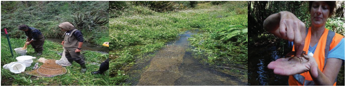
Mahinga Kai Distribution Surveys

Mahinga Kai Distribution Surveys have been conducted and various data has been collected at specific sites within our rohe. This will assist us to continue our journey in working towards improving Mahinga kai values in the upper Waikato River catchment and inform future restoration and rehabilitation activities.