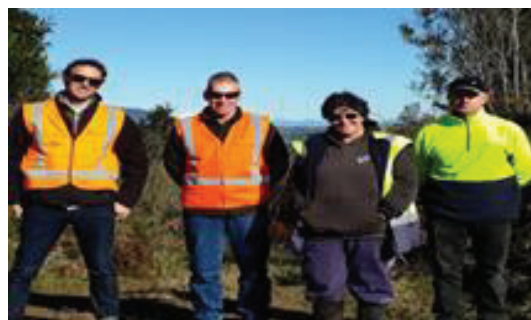
Kaimanawa visit at Te Toke with Wairakei Pastoral